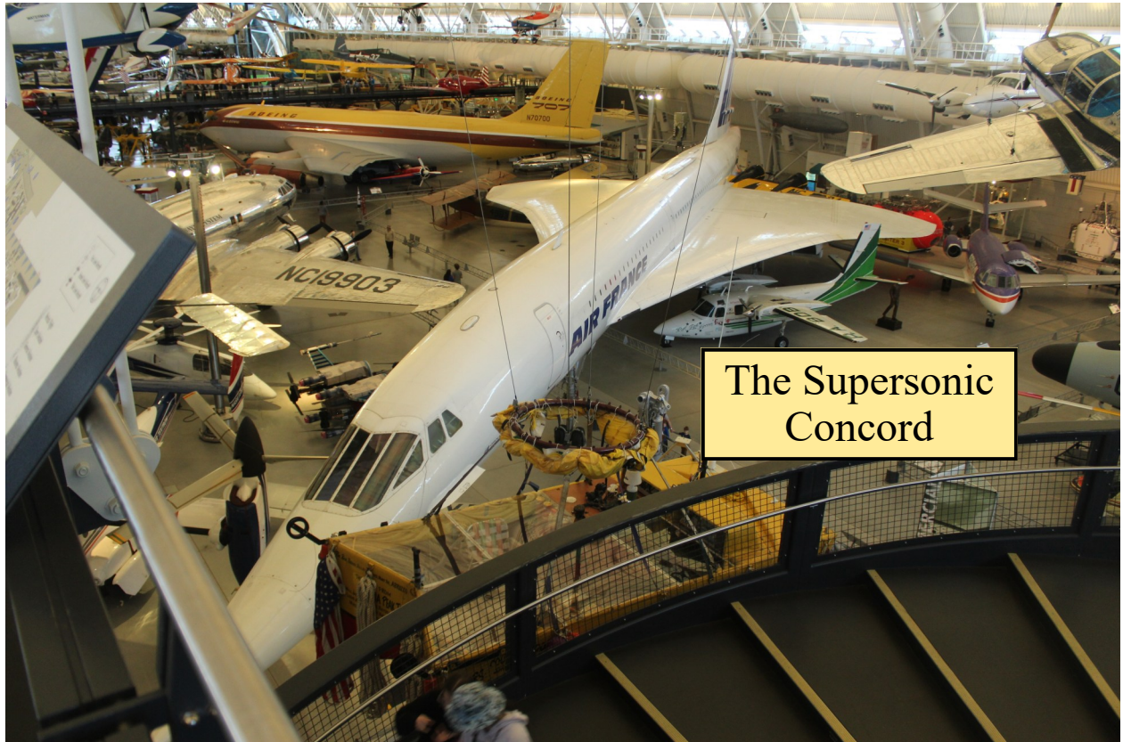
The Supersonic Concord