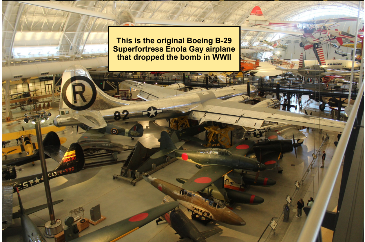
This is the original Boeing B-29 Superfortress Enola Gay airplane that dropped the bomb in WWII