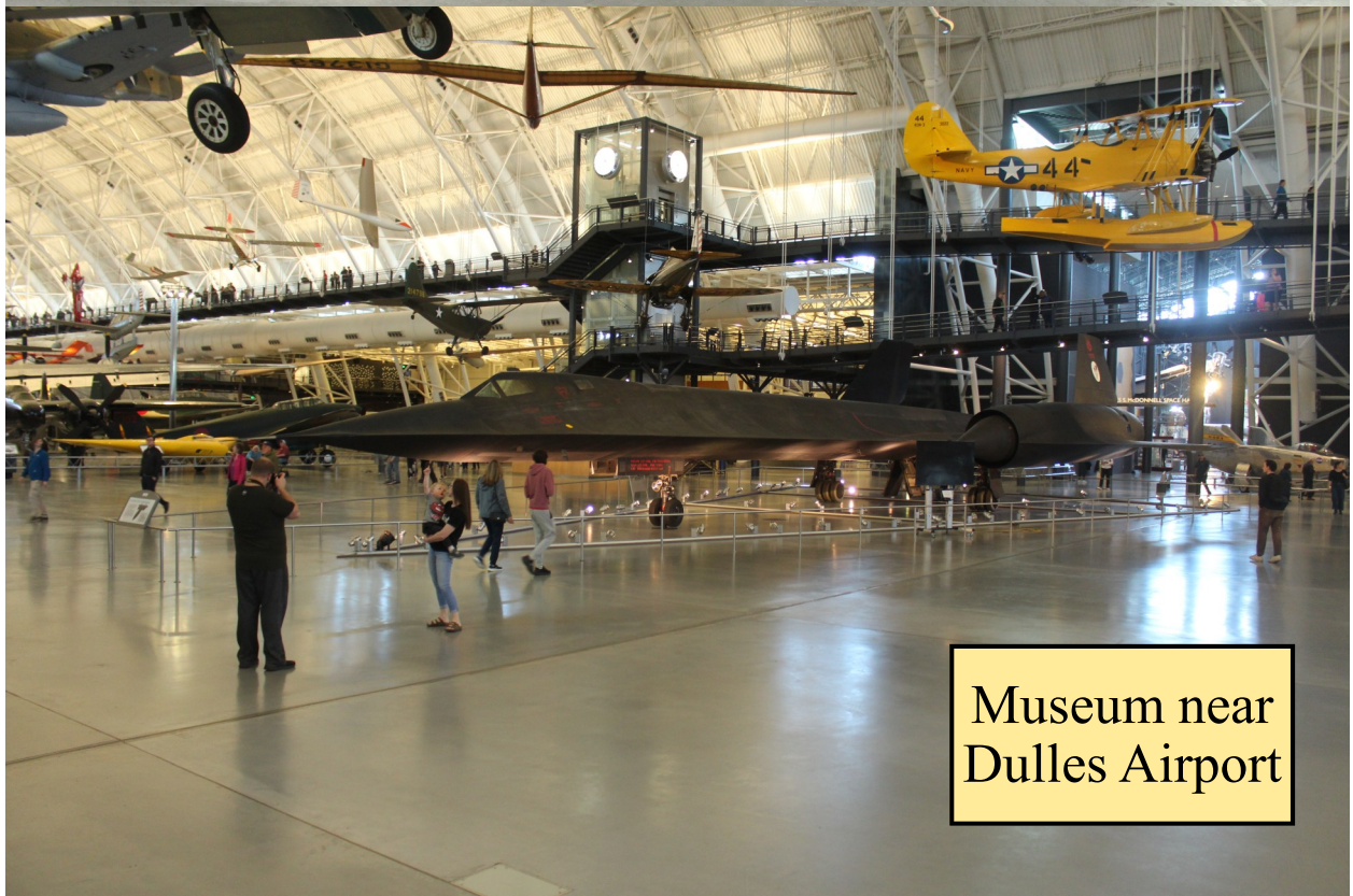
Museum near Dulles Airport